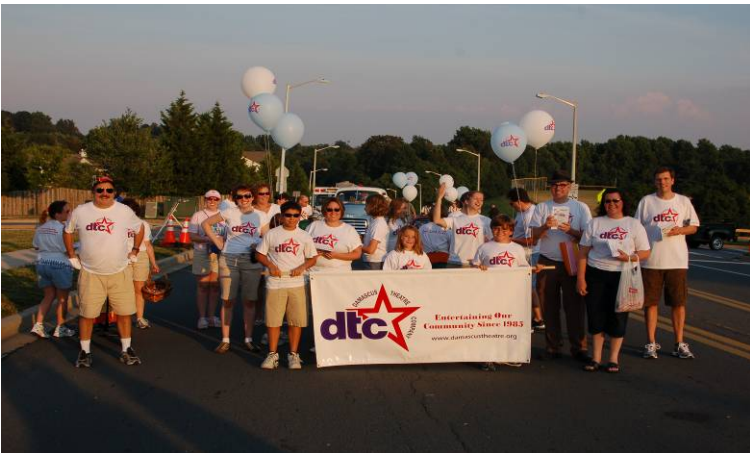
Several DTC members marched in the Celebrate Damascus Parade on July 11.