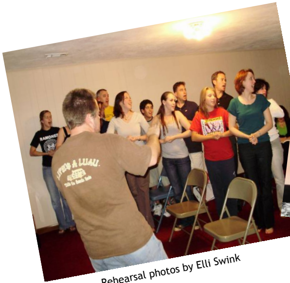
Rehearsal photos by Elli Swink